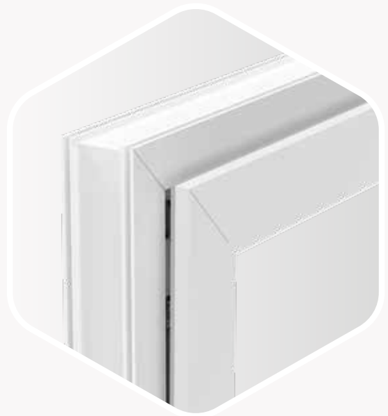
Window with night vent