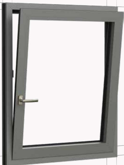
Single-sash tilt-and-turn window