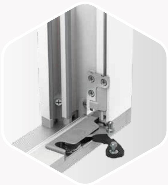
Balcony door with threshold