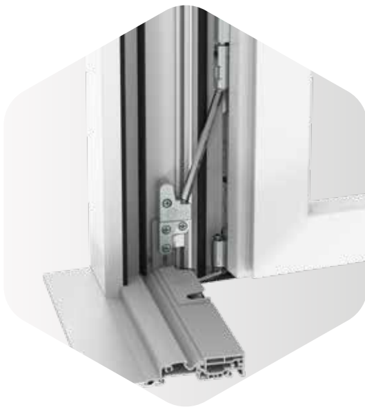
Threshold with PVC frame profile

The load transfer device from MACO is perfect for use with balcony and patio doors that let in a lot of light. With this device you can fabricate balcony doors up to 180 kilograms and with a concealed hinge side. The load transfer device is easily installed thanks to the drilling jig – even when retrofitting. An additional advantage is the simple, "mount and go" procedure for the sash. The load transfer device also relieves stress on the pivot post, which vastly lengthens its service life.