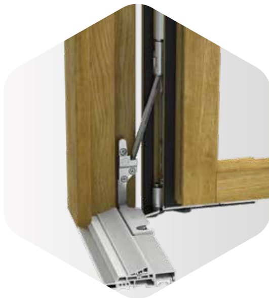
Threshold with timber frame profile

You can also use our load transfer device with thresholds without any limitations.