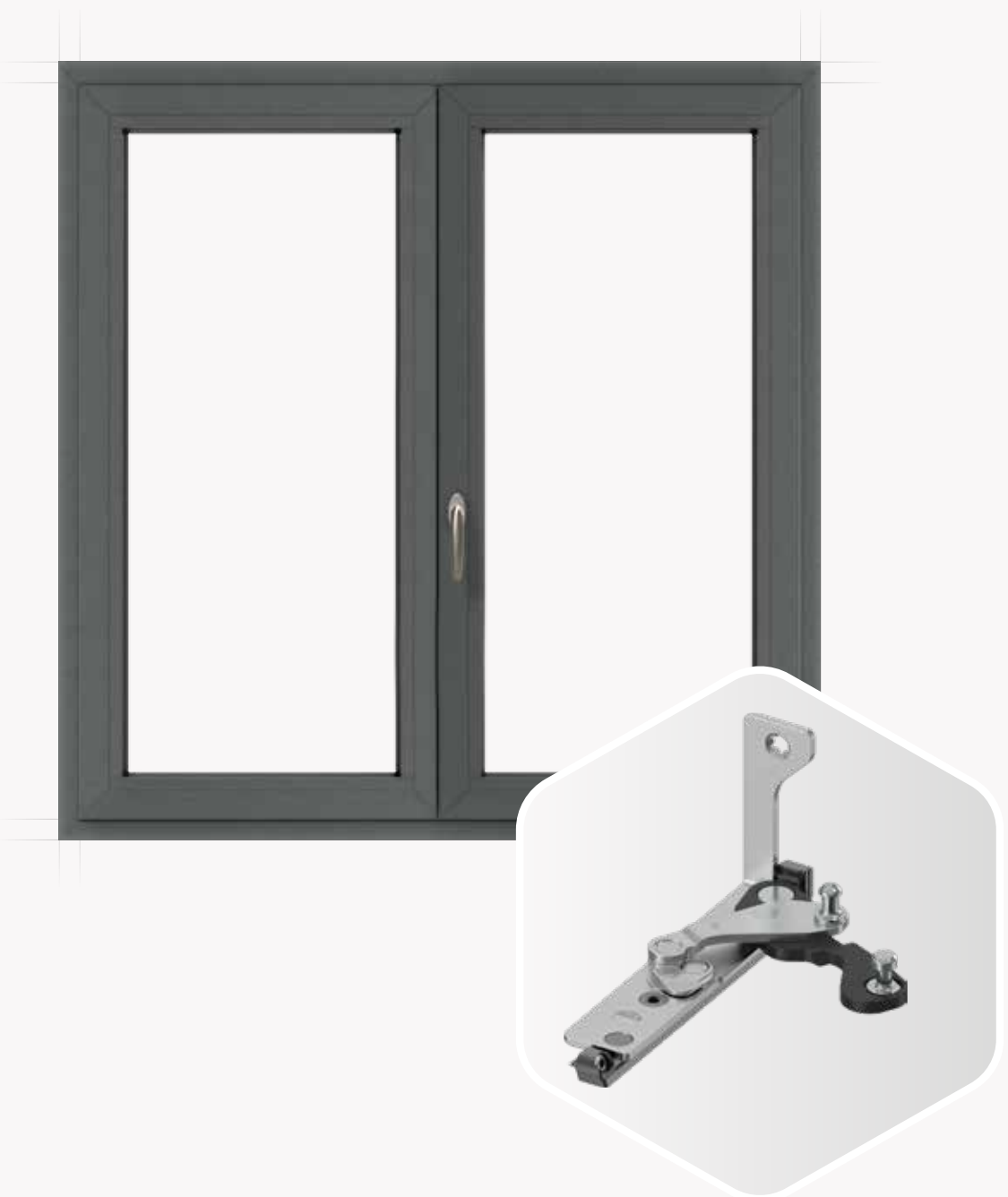
Multi Power clampable

Multi Power clampable is a concealed fitting for aluminium windows with a 16 mm fitting groove. Its use of clamps instead of screws makes it easy to install. It can handle sash weights of up to 120 kilograms and French windows up to 150 kilograms, depending on the profile.