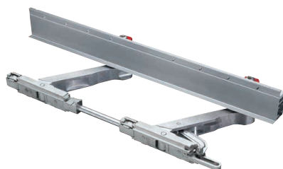
TANDEM ROLLER SKB-Z Supports sash weights of up to 200 kg