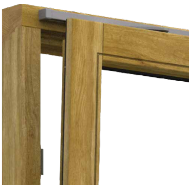
TILT VENTILATION SKB-Z Lets in fresh air