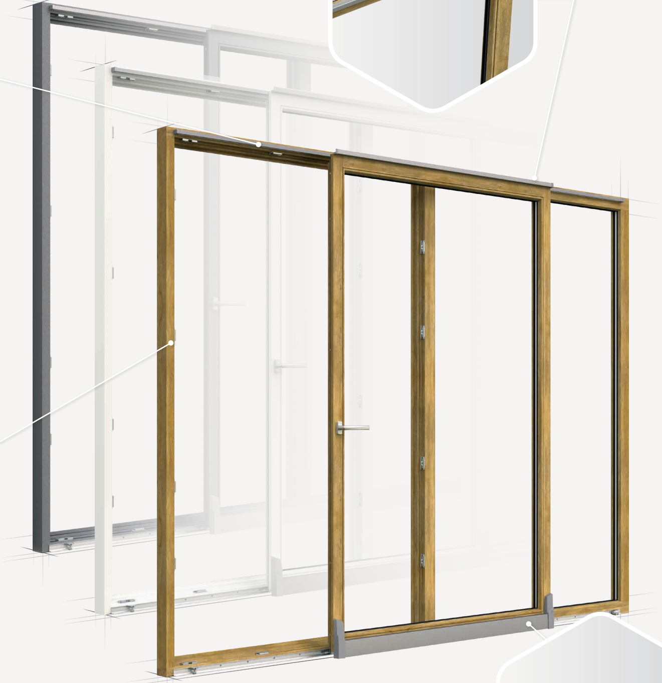
POWER ACCUMULATOR For timber – effortless operation