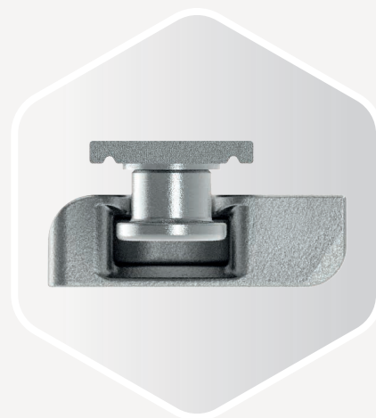
SECURITY ROLLER CAM Included as standard

Preventing break-ins is one of the most important requirements for windows, doors, and balcony doors. This is why we include the I.S. Roller Cam (I.S. stands for "intelligent security") as standard. It significantly enhances the security of your slide & tilt system, with security never below Resistance Class 2.