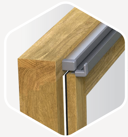
OPENING FOR VENTILATION Just five millimetres – invisible from the outside

Does your customer want comprehensive convenience together with RC2 security, even in the vented position? Then opt for the PAS premium class. This unique solution provides safe, effortless operation: the damper and spring mechanism enable the sash to retract automatically. The system is perfectly rounded off by passive, all-round ventilation, and the handle operates as with tilt & turn windows.