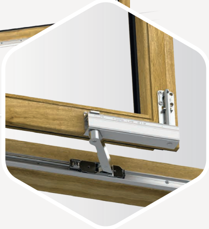
ROLLER 160 KG