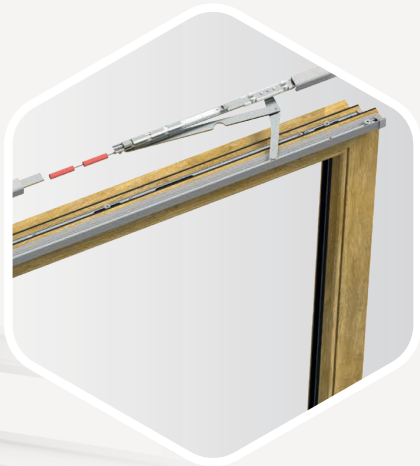
STOP ABSORBER For ease of use