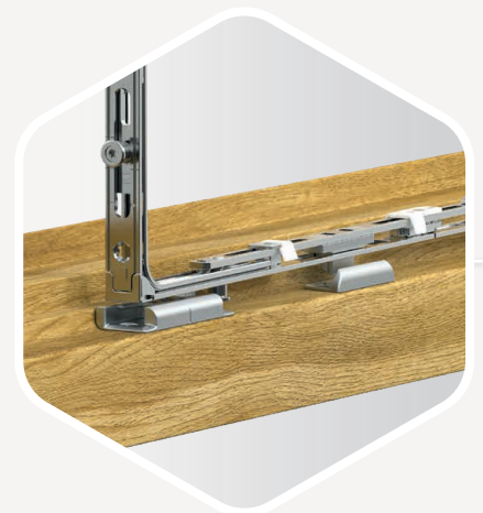
LATCH ON THE CORNER ELEMENT